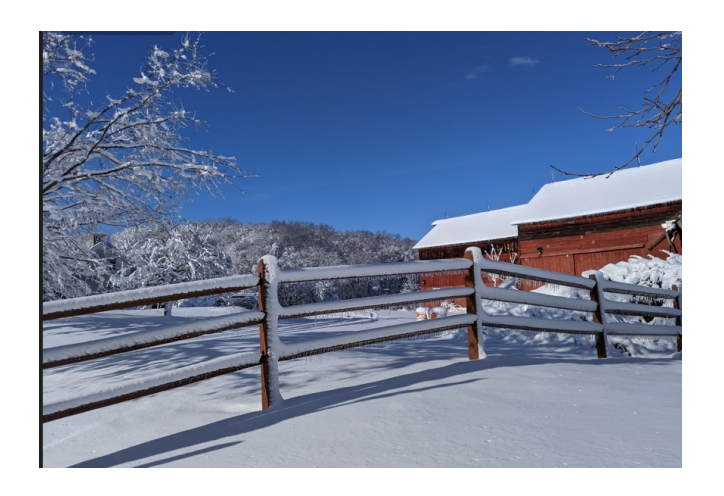
Show Us Fredon Through Your Camera Lens! Photo Contest Entries Due February 15th 6th ANNUAL FREDON PHOTO CONTEST

We so often hurry through life and neglect to look around and see exactly why many of us have chosen to live here, with a great quality of life, fresh air and open spaces surrounding us. Send us your photos of beauty and life in Fredon! We are now accepting photos for the 2024 Photo Contest! These days it seems that most people have a cell phone at the ready, so look through your gallery or media folder and send us some great shots! Or, get out there on a winter day and take some new ones.