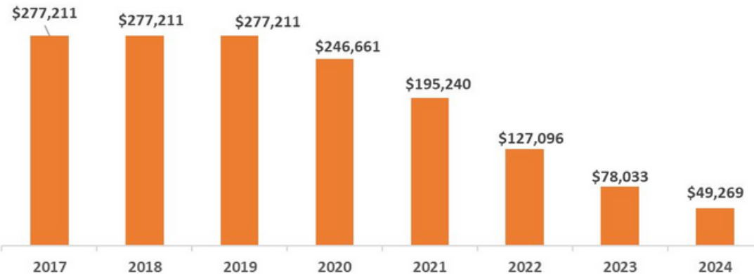
State Equilization Aid History 2017-2024